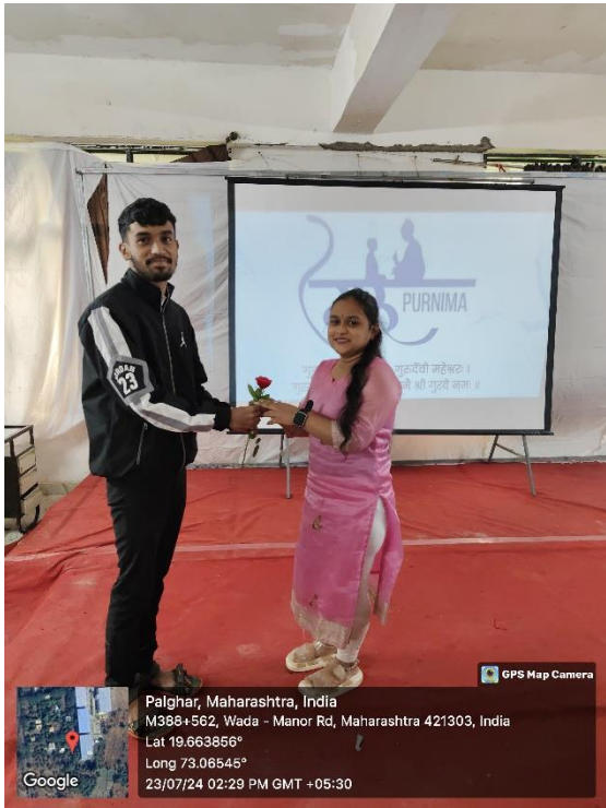
Palghar, Maharashtra, India M388+562, Wada - Manor Rd, Maharashtra 421303, India Lat 19.663856° Long 73.06545° 23/07/24 02:29 PM GMT +05:30