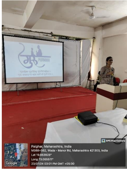
Palghar, Maharashtra, India M388+562, Wada - Manor Rd, Maharashtra 421303, India Lat 19.663928° Long 73.065511° 23/07/24 03:01 PM GMT +05:30