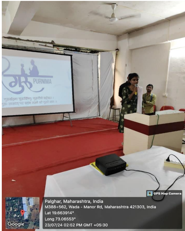
Palghar, Maharashtra, India M388+562, Wada - Manor Rd, Maharashtra 421303, India Lat 19.663914° Long 73.06553° 23/07/24 02:52 PM GMT +05:30