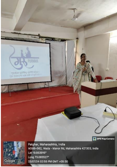
Palghar, Maharashtra, India M388+562, Wada - Manor Rd, Maharashtra 421303, India Lat 19.663916° Long 73.065527° 23/07/24 02:55 PM GMT +05:30