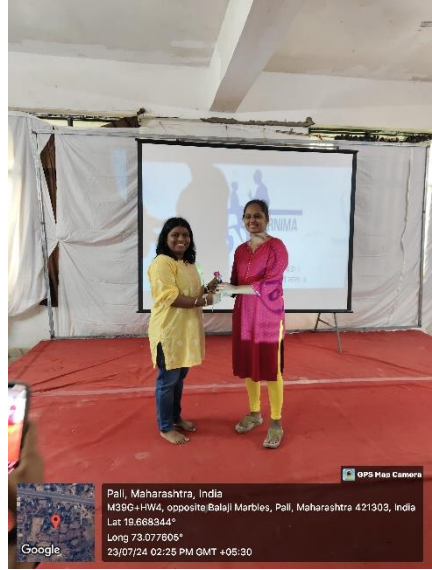
Pali, Maharashtra, India M39G+HW4, opposite Balaji Marbles, Pali, Maharashtra 421303, India Lat 19.668844° Long 73.077805° 23/07/24 02:25 PM GMT +05:30